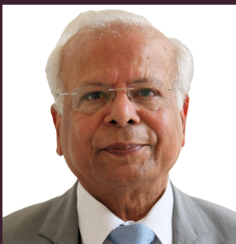
Dr. Ishrat Husain Professor Emeritus, IBA Karachi

For detailed profile please visit website